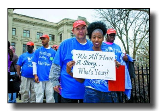
Advocates attend Disability Day 2016 down at the Capitol.