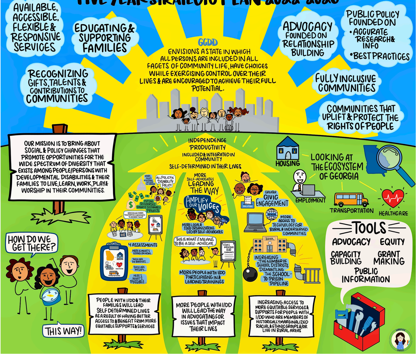
The Five Year Strategic Plan infographic created by Gabby Melnick is designed to show the plan in a visually pleasing and simplified format.

organizations that represent people with physical disabilities, older adults, poor people, people with mental health issues, people who live in rural communities, and others working to create social change resulting in a better Georgia for everyone. Finally, it means supporting coherent public policies through analysis and advocacy that support individuals