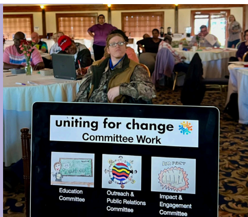
Uniting for Change leadership retreat

In 2022, the Leadership Collective of Uniting for Change will focus on growing local area networks of self-advocates and allies and supporters by creating awareness, interest, participation, commitment and leadership within the self-advocacy movement. These networks will move the priorities of change forward with voices that will RISE UP and SPEAK OUT!