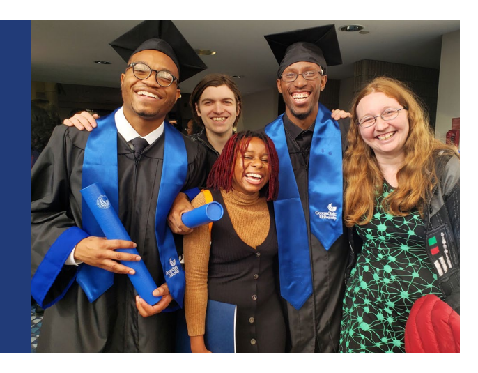
Georgia State University IDEAL graduates pose on graduation day

For more information on the GSU IDEAL program, visit <u>CLD.GSU.edu/IDEAL</u>.