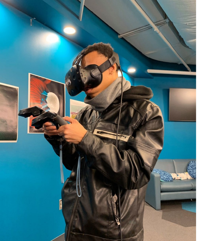
Georgia State University IDEAL student uses VR

Inclusive college, called inclusive post secondary education (IPSE), is not new to Georgia, and there is a positive trend of more and more universities developing IPSE. There are <u>311 IPSE programs</u> at universities across the country, with <u>eight in Georgia</u> (and a ninth on its way). The expansion of IPSE is demonstrating how university administrations and faculty are beginning to understand the importance, and the value, of inclusive college for people with intellectual disabilities.