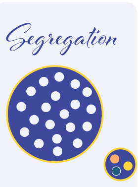
Segregation occurs when the participation of students with disabilities is provided in separate environments designed or used to respond to a particular or various impairments, in isolation from people without disabilities.

Exclusion can be overt or can be hidden within restrictive policies, often citing legal or insurance reasons as rational for excluding people with developmental disabilities.