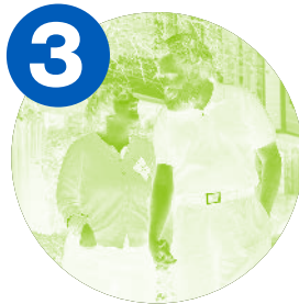
3 Formal/Informal Supports