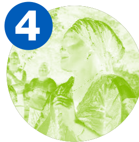
4 Real Communities