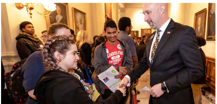
Several Georgia legislators met with disability advocates in the halls of the State Capitol during the 2019 legislative session. Advocates were participating in this year's GCDD Advocacy Days training sessions.