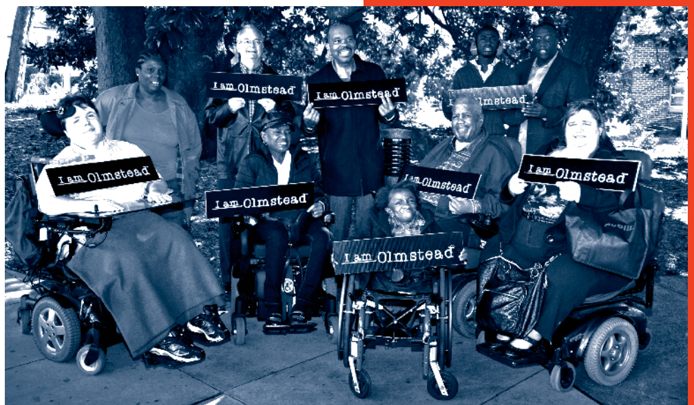
Center for Mental Health Law in Washington, DC. The nonprofit represents various stakeholders in the system.

THE DEADLINE TO IMPLEMENT THOSE CHANGES EXPIRED AT THE END OF JUNE 2015, AND GEORGIA WAS NOT ABLE TO MEET THE SETTLEMENT.