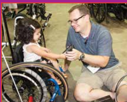
Attendees at the 2015 Mobility Expo viewing the latest technologies, products and services for people with disabilities.

opportunity. At jobs they had to give me a real look and not just say they couldn't hire me because I'm in a chair."