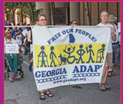
Georgia ADAPT marches to the slogan “Free Our People” in support of equal rights for people with disabilities.