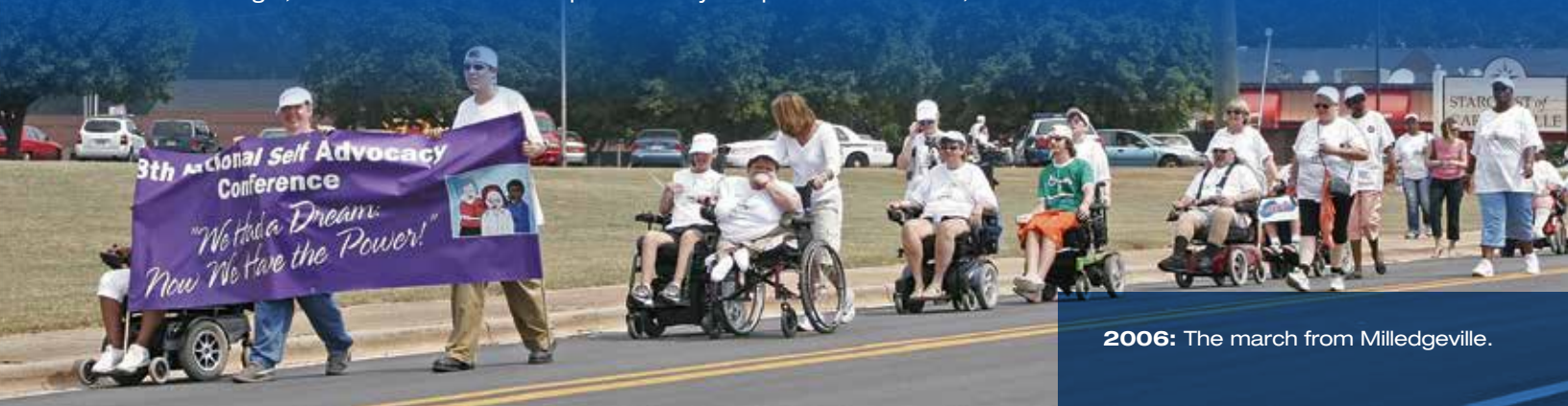
2006: The march from Milledgeville.