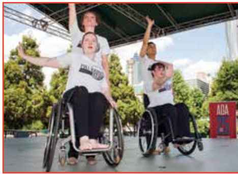
Full Radius Dance, a professional physically integrated dance company, closed the festivities of the ADA25 Georgia Legacy Parade.

A performance by Full Radius Dance, a professional physically integrated dance