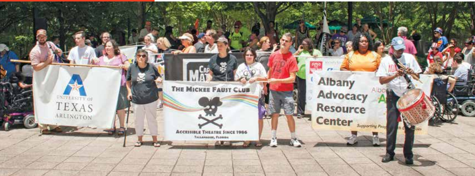
Disability advocates assemble on a hot summer day in Downtown Atlanta's Hardy Ivy Park, at the start of the ADA25 Georgia Legacy Parade.