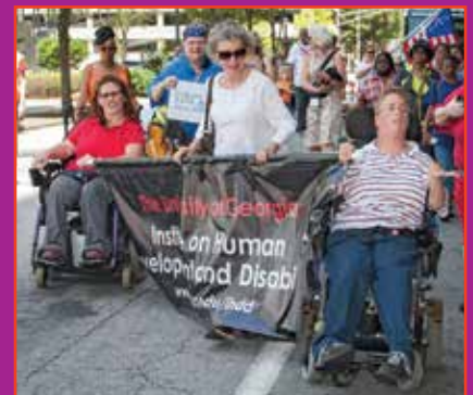
University of Georgia’s Institute on Human Development and Disability proudly participates in the parade.