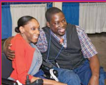
Actor on the TV show NCIS: New Orleans (r) and active wheelchair user Daryl "Chill" Mitchell was a guest speaker at the expo.