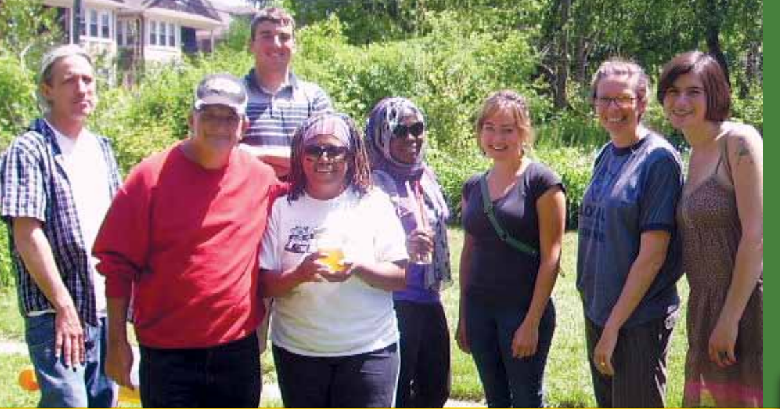
The Detroit Learning Journey