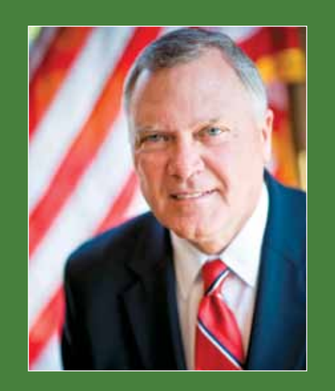
"The regional transportation referendums on the ballot in July will help make transportation available to every Georgian."