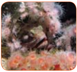
A fish tries to swim away, but he can't hide - CATEA's accessible aquarium project is being developed for people with vision impairment to be able to detect what is going on in a tank at any given moment.

veryone knows the frustrations of wanting to be able to do something but being unable to fulfill wants and needs. But what once seemed impossible is now possible, thanks to new technologies being developed around the world.