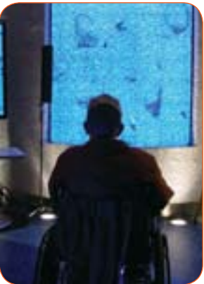
the test aquarium for CATEA's