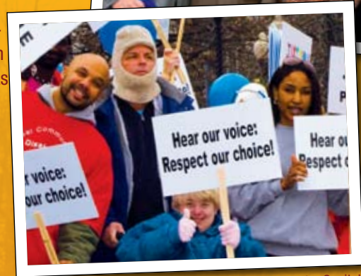
Advocates rally at the Capitol.

"It's time to close and never, ever reopen those institutions!"