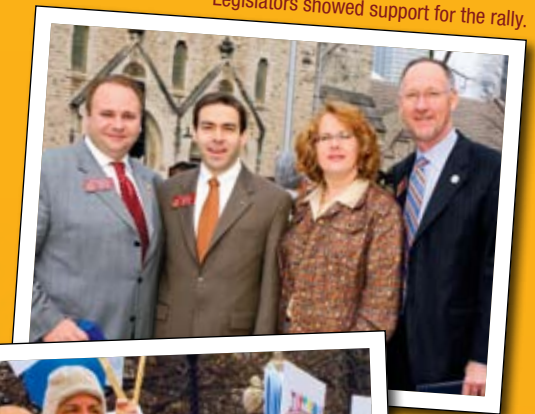
Legislators showed support for the rally.

Discovery Day also served as the platform for the release of the "Georgia Inclusive Travel & Tourism Concept Paper," the debut piece from the Georgia Alliance for Accessible Technologies.