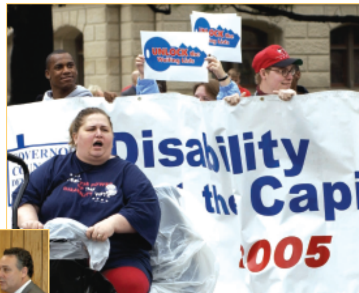
Above: Self-advocates make their voices heard. Left: Sen. Sam Zamarripa (D-Atlanta) shares the best way to reach legislators.