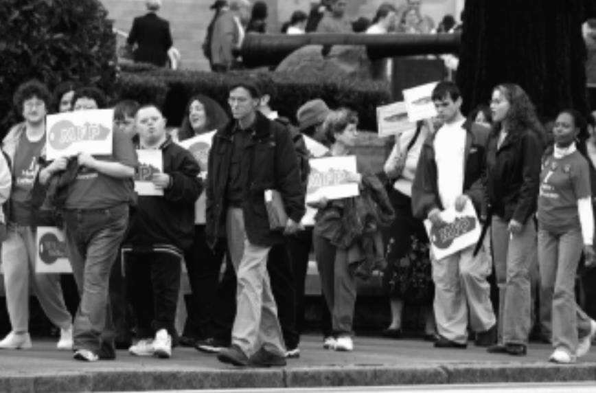
Self-advocates, parents and service providers shared their hopes for the future.